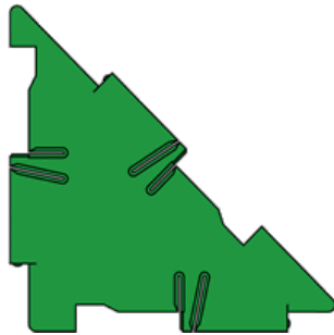
Right angled isosceles