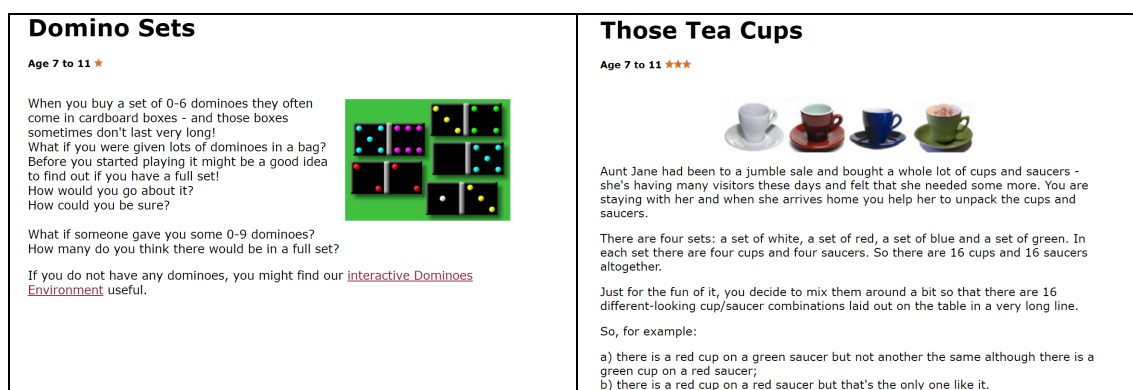
Figure 1: Two of the existing NRICH problem-solving activities identified by the teachers as suitable for teaching at greater depth.

Using this approach, the teachers identified activities such as Amy's Dominoes ( rich.maths.org/1044 ) and Tea Cups ( rich.maths.org/32 ) (Figure 1) as suitable problem-solving activities for teaching at greater depth.