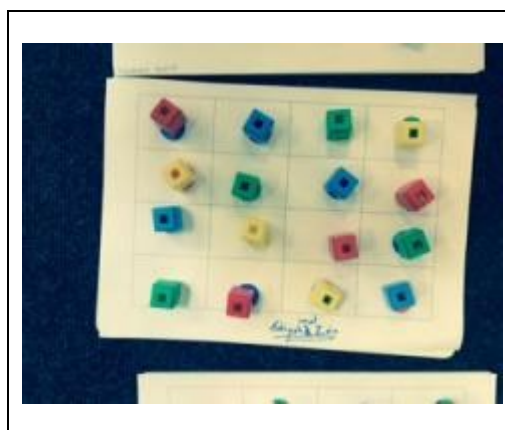
Figure 2: Pupils were encouraged to share their ideas with their classes by placing their work on the floor.

The ability to clearly communicate ideas is one of the key aspects of working at greater depth (Askew et al.,2015). In each of the observed classes, pupils were encouraged to share their ideas throughout their lessons. In one class in School2 , each pair was encouraged to lay out their answer to the Tea Cups activity on the floor so that the others could explore their solutions and write up their findings (Figure 2).